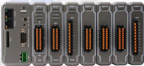
(I/O modules not included)